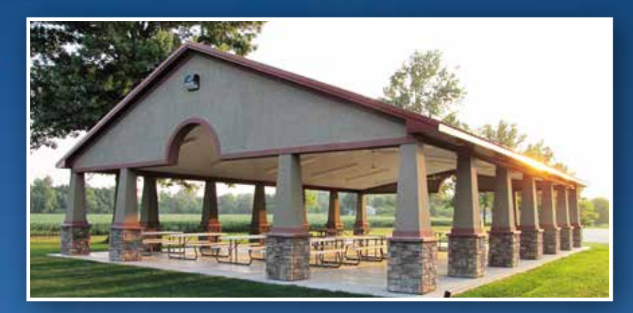
Lima, OH 2,400 sq. ft.