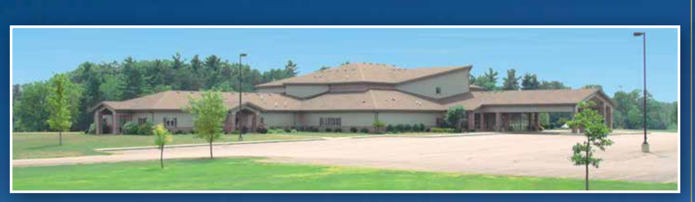
Germantown Hills, IL 27,300 sq.ft.