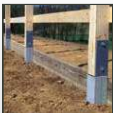
Special Foundation Options