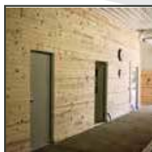
Interior Wall Finishes