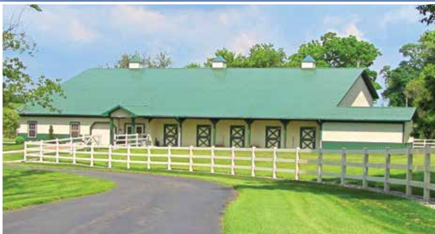
52' x 104' x 18', 27' x 104' x 9'

Understanding your lifestyle and needs is one of our top priorities. We use the information gathered to create a unique space that is functional and a reflection of your taste. Translating that into a building design is important since that is what others see. It is an expression of you.