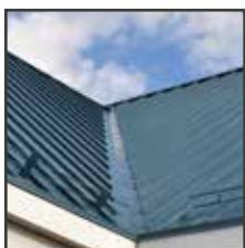
Standing Seam Steel