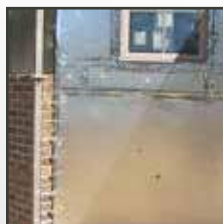
High Efficiency Insulation