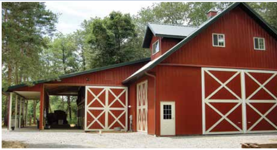
40' x 64' x 14'

Understanding your lifestyle and needs is one of our top priorities. We use the information gathered to create a unique space that is functional and a reflection of your taste. Translating that into a building design is important since that is what others see. It is an expression of you.