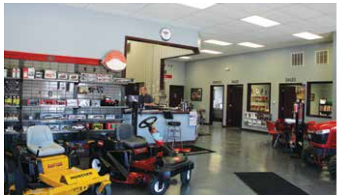
Plevna Showroom floor

money, which means more profitability to the bottom line. The building structure maximizes all these requirements while making sure it meets your budget requirements. Our goal at Borkholder Buildings is to create as much value to your new project as possible.