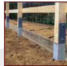
Special Foundation Options