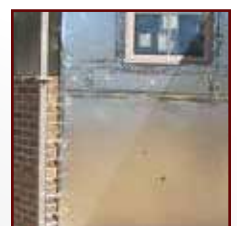
High Efficiency Insulation