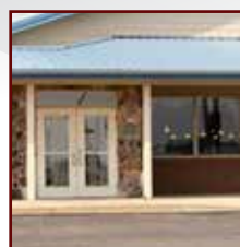
Commercial Doors and Windows