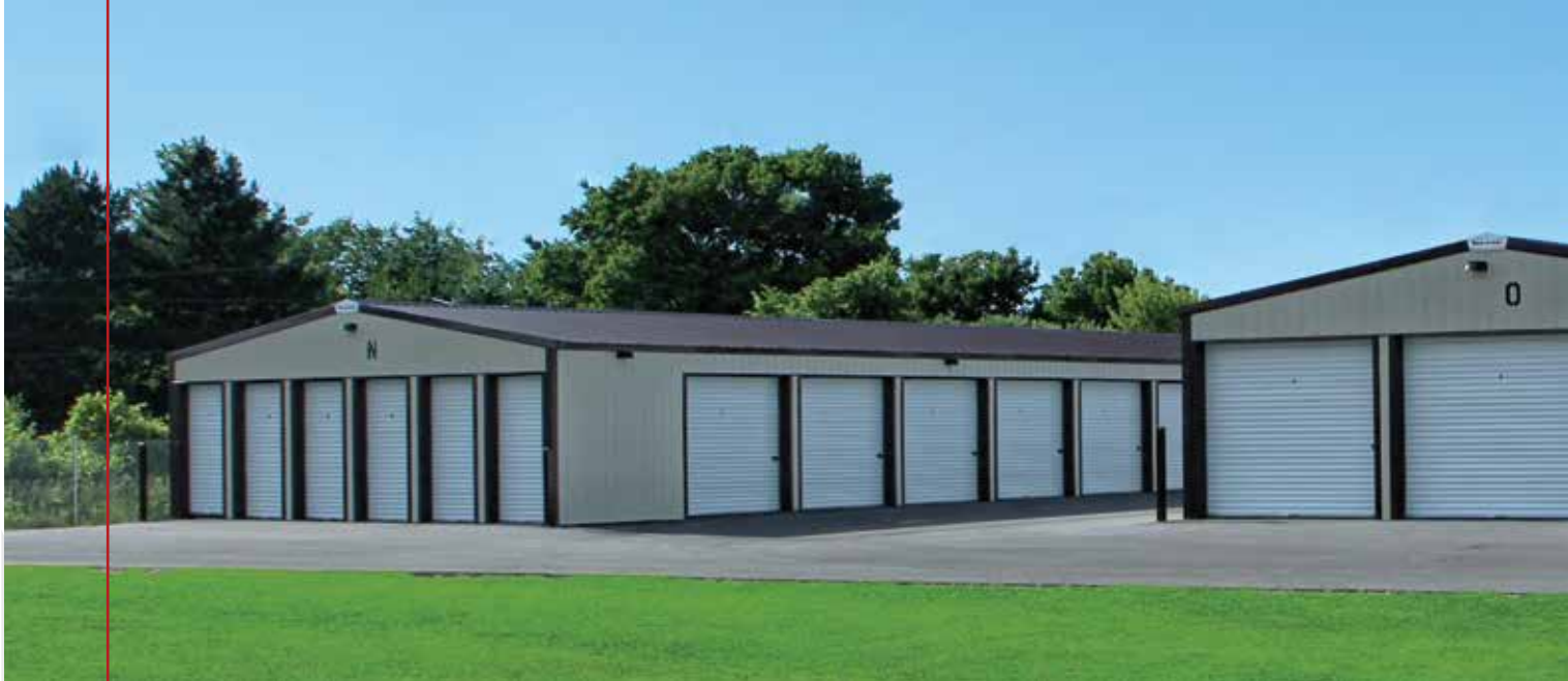
30' x 250' x 10'