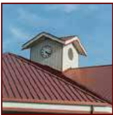
Standing Seam Steel