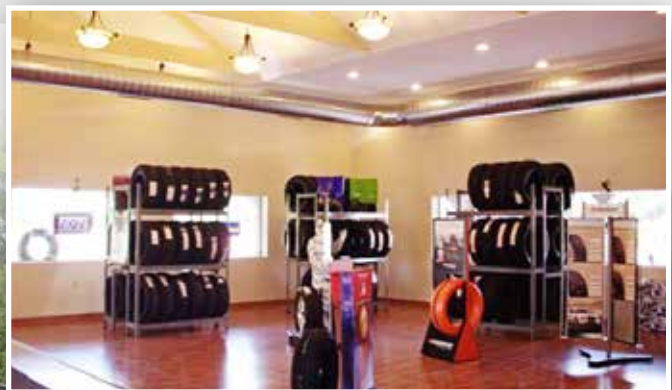
Tire Tracks Showroom floor