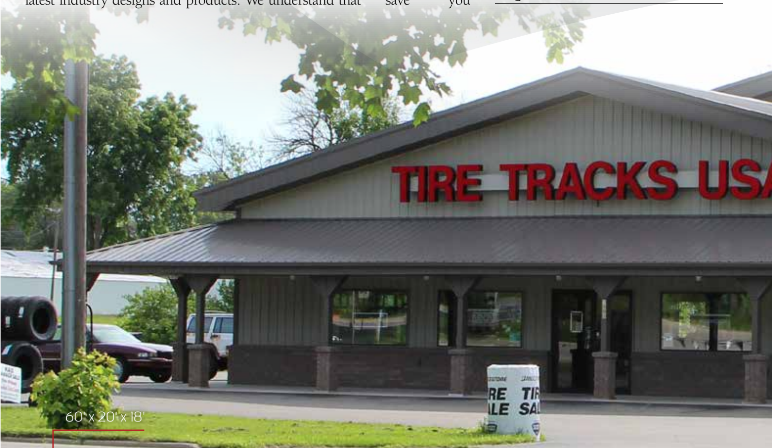
60' x 20' x 18'