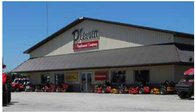
72' x 120' x 16'